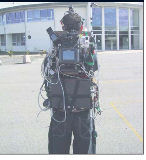
Figure 3. Tinmith outdoor

AR systems, ARQuake being one of the first.